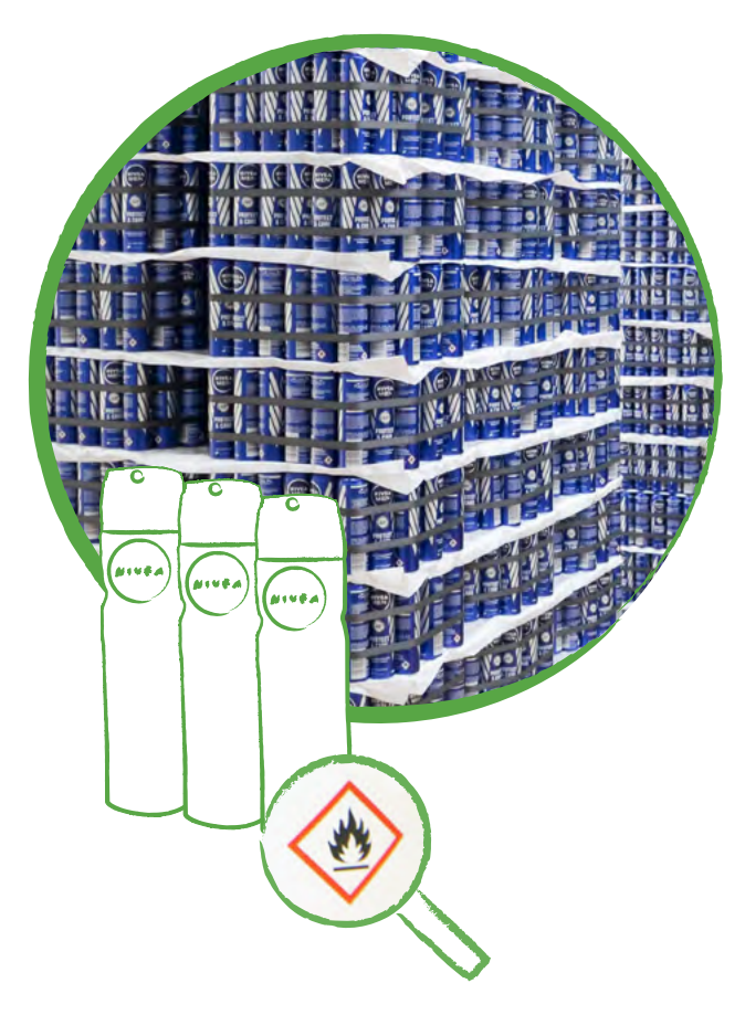
All our aerosol can designs needed rework to integrate the new hazardous materials labeling.

Learn more about our activities in the area of dangerous goods