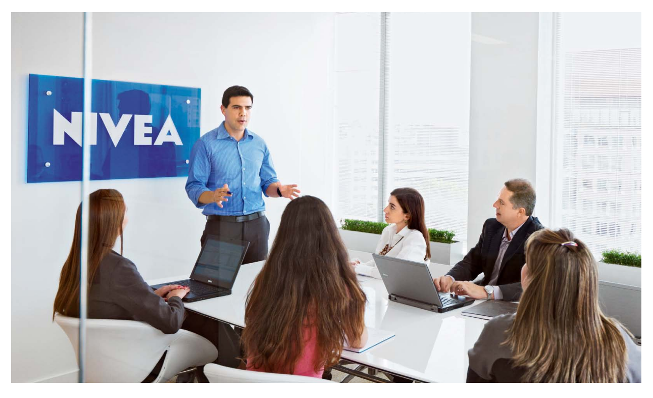
Beiersdorf employees discuss the latest fragrances: Brazilian consumers set great store by pleasantly perfumed shower and care products