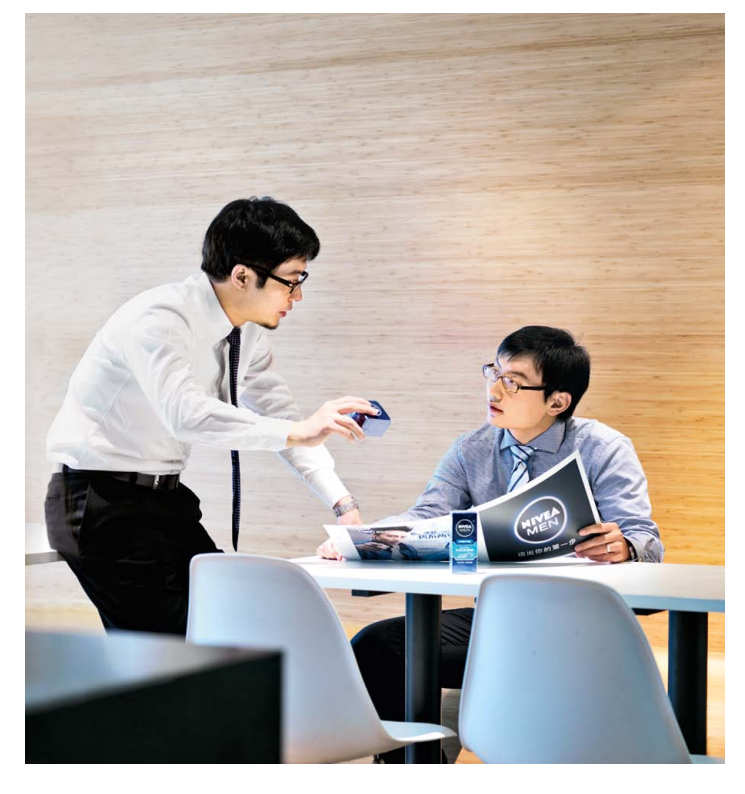
The NIVEA MEN's care product line is very popular in China

Identifying these unique regional features and consumers needs depends on a long, intensive dialog. It all starts with keeping our ears and eyes open. Only then can Beiersdorf employees understand the specific needs of consumers around the world. From market and trend research through marketing down to consumer service and product development - a large number of Beiersdorf teams worldwide are dedicated to satisfying consumer wishes in the individual markets. The regional skin research centers such as the recently opened center in Wuhan (China) or in Silao (Mexico), where a new research center is currently being built, play a particularly important role. In 2012, over 800 studies were conducted in the different regions (including Europe, China, Brazil, Russia, the USA, and Thailand) in cooperation with around 50 international test institutes. The valuable insights acquired in this way can be used to adapt products to the specific requirements of consumers in the various regions. Our success is immediately apparent: in the satisfaction of our consumers and in their loyalty to our brands. In fact, many of our consumers around the world think NIVEA is a local brand from their home country. We call this philosophy "Closer to Markets." in our corporate strategy.